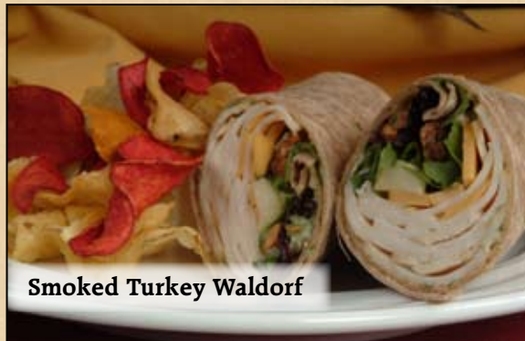
Smoked Turkey Waldorf

DELI BASICS PLATTER.....$4.95 Roast Beef, Turkey & Ham on Fresh Baked Multi-Grain, White & Cheddar Loaves